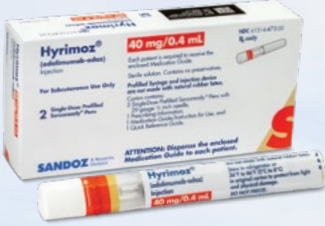
HYRIMOZ (High WAC)

Offering 2 presentations ensures broader access for your patients. Insurance coverage will determine whether your patient receives HYRIMOZ or adalimumab-adaz.