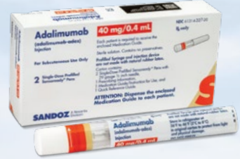
adalimumab-adaz (Low WAC)